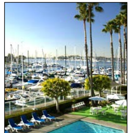
The harbor view from LA's Marina del Rey Hotel

For more details or to register online, go to www.napia.com .